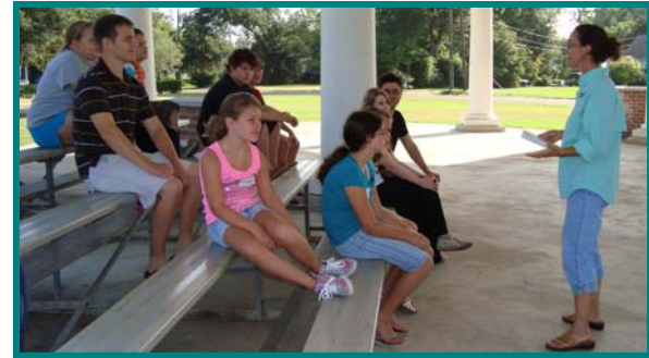
Top Right: re-growing wetland plants demonstration Above: discussing wetlands Left: showing off the grass seed souvenir

LSU Coastal Roots Program takes students from 3 rd grade through high school in south Louisiana and establishes wetland plant nurseries at their school. Students grow native plants seedlings that they will plant in a coastal habitat restoration project in south Louisiana. There are 38 schools across 18 parishes currently participating in this program. The CPC has met with the Coastal Roots to connect together and integrate this into Calcasieu parish schools. Coastal Roots has all of the necessary lesson plans and paperwork to supply to the teachers for seamless incorporation.